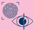
Different identification formats