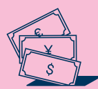
Multicurrency within one deposit